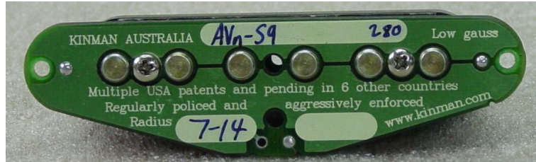
Typical offset baseplate of Strat pickups.